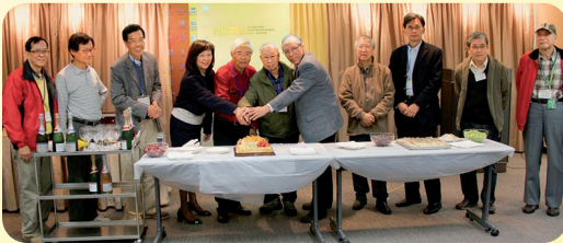
2017: 5th Anniversary Celebration