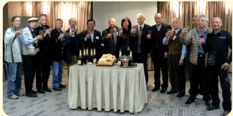
2014: 2nd Anniversary Celebration