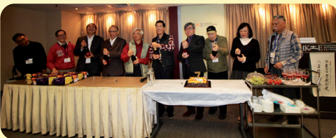
2019: 7th Anniversary Celebration