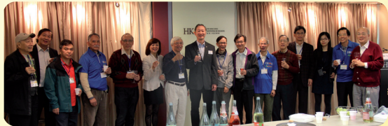
2016: 4th Anniversary Celebration