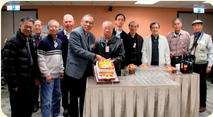
2013: Anniversary Celebration