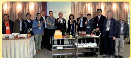
2020: 8th Anniversary Celebration

Dur to COVID-19, there was no anniversary celebration in 2021 and 2022.