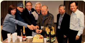
2015: 3rd Anniversary Celebration