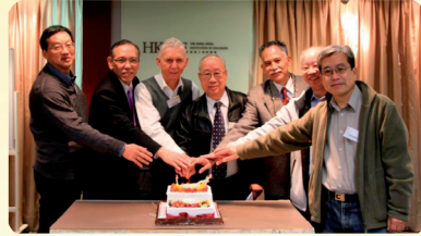
2012: Inauguration Celebration

The HKIE Veneree Club was first established on 18 Jan 2012 with the idea of HKIE being a home for engineers for life, to serve its members and to reunite retired members.