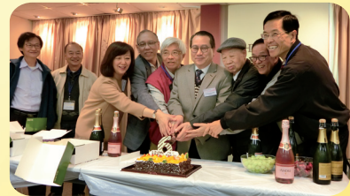
2018: 6th Anniversary Celebration