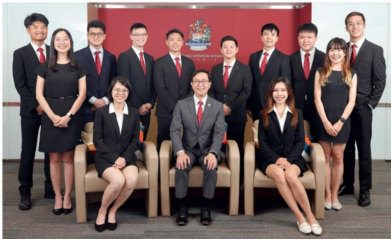
The Hong Kong Institution of Engineers President’s Protégé Scheme 2024/25

A young force driving the engineering industry