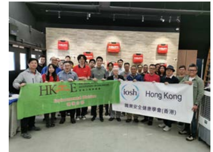
Visit to Hilti Experience Centre