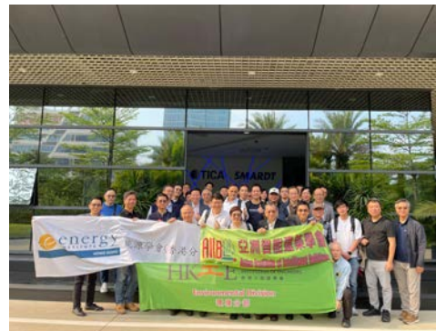
Technical Visit to Tica-SMARDT Guangzhou Factory