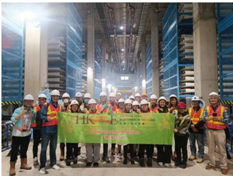
Technical Visit to TKO Desalination Plant