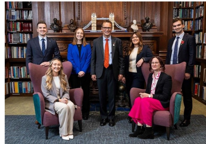
The President's Future Leaders Scheme 2024-25 of Institution of Civil Engineers