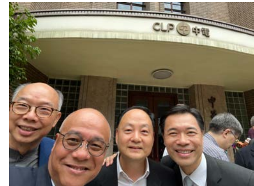
Visit to CLP Pulse