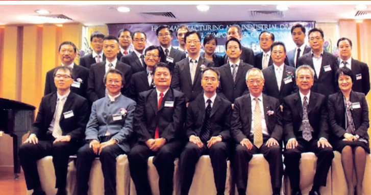
Guests of Honour and the Organising Committee of the Annual Symposium (MI)