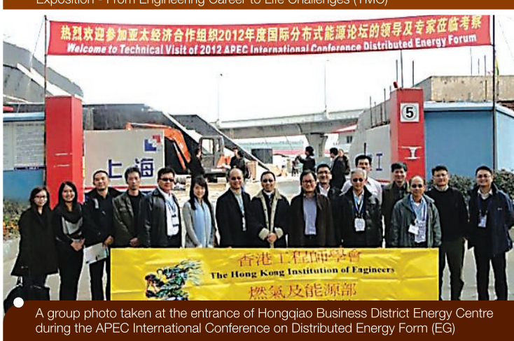
A group photo taken at the entrance of Hongqiao Business District Energy Centre during the APEC International Conference on Distributed Energy Form (EG)