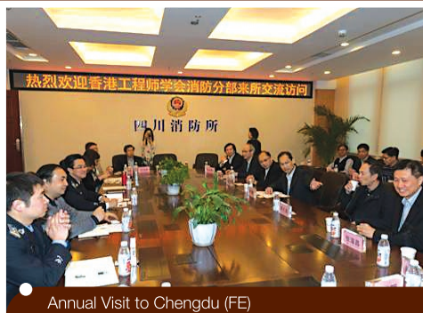
Annual Visit to Chengdu (FE)