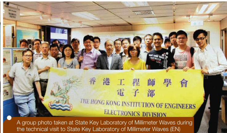
A group photo taken at State Key Laboratory of Millimeter Waves during the technical visit to State Key Laboratory of Millimeter Waves (EN)