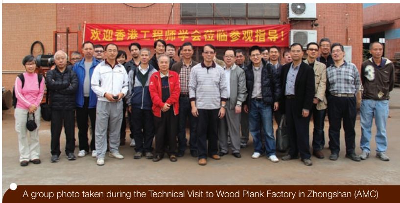
A group photo taken during the Technical Visit to Wood Plank Factory in Zhongshan (AMC)