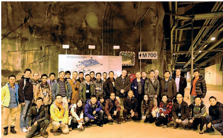
Visit to Viikinkaari Wastewater Treatment Plant at Finland during Delegation Visit to Finland and Norway (GE)