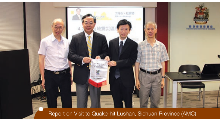
Report on Visit to Quake-hit Lushan, Sichuan Province (AMC)