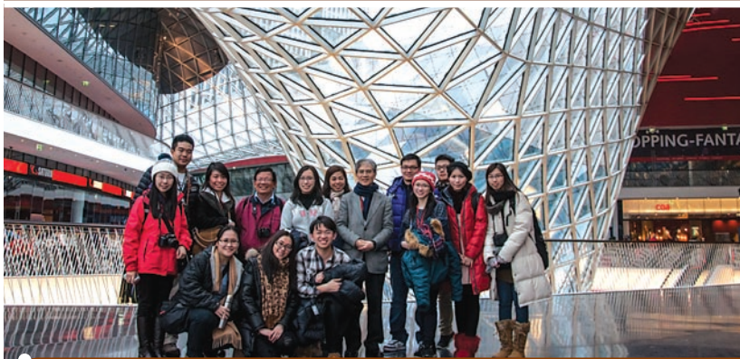
A group photo of advisors and delegates taken during the HKIE-YMC Overseas Delegation 2013 to Germany - Forge Vintage and Innovation with Faith and Heart (YMC)