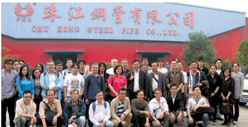
A group photo of delegates taken during the Site Visit to Chu Kong Steel Pipe Factory at Panyu (SSC)