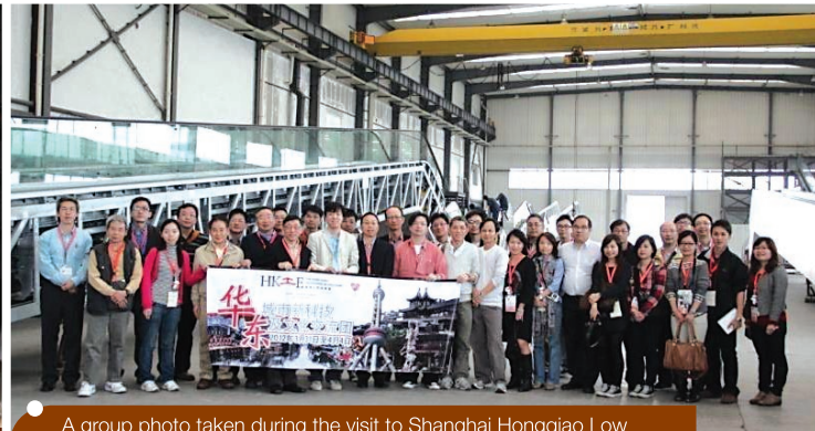
A group photo taken during the visit to Shanghai Hongqiao Low Carbon Business Centre (BS)