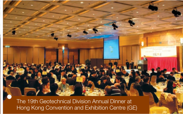
The 19th Geotechnical Division Annual Dinner at Hong Kong Convention and Exhibition Centre (GE)