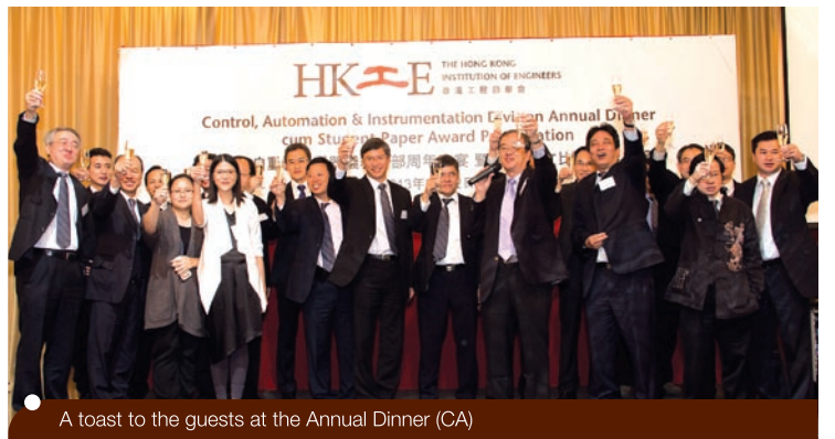
A toast to the guests at the Annual Dinner