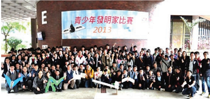
A group photo of our future "inventors" taken at the Young Inventor Competition on "Pressurised Air Jet Glider" (MC)