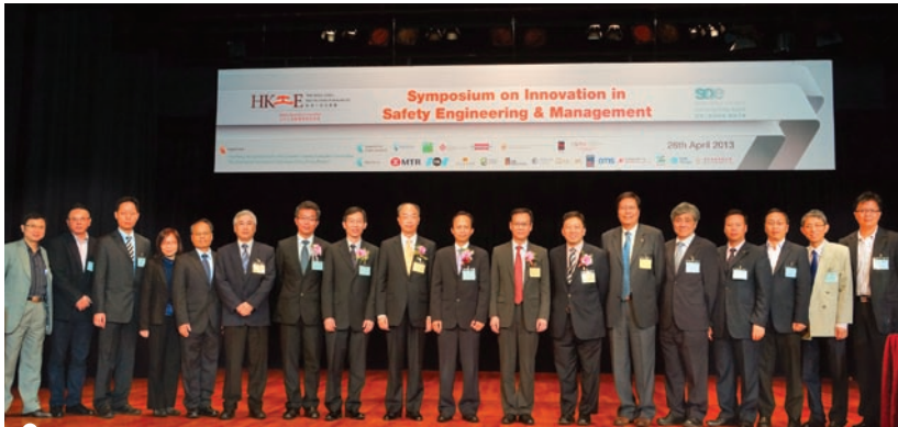
A group photo of Guests and the Organising Committee taken at the Symposium on Innovation in Safety Engineering and Management (SSC)