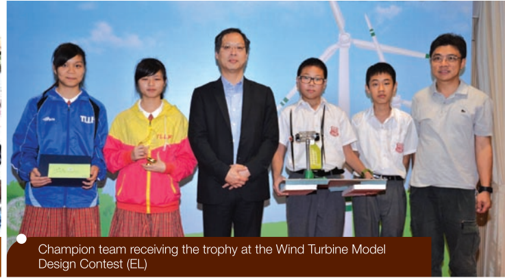
Champion team receiving the trophy at the Wind Turbine Model Design Contest (EL)