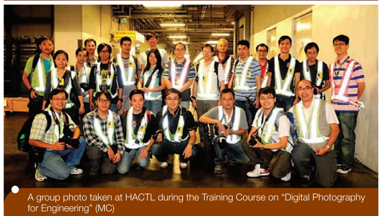
A group photo taken at HACTL during the Training Course on "Digital Photography for Engineering" (MC)