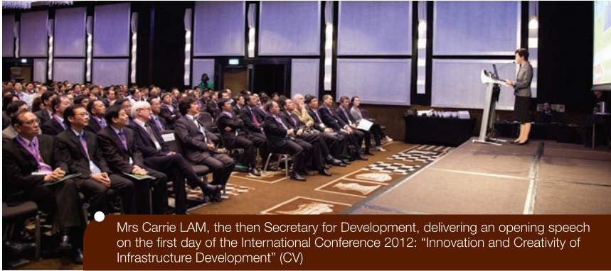
Mrs Carrie LAM, the then Secretary for Development, delivering an opening speech on the first day of the International Conference 2012: "Innovation and Creativity of Infrastructure Development" (CV)