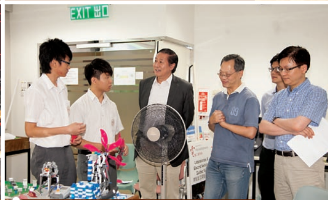
Presentation by the finalists at the Energy Innovation Project Competition (EL)