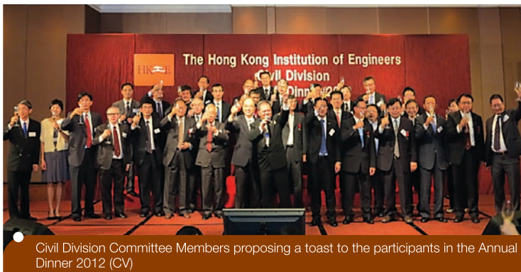
Civil Division Committee Members proposing a toast to the participants in the Annual Dinner 2012 (CV)