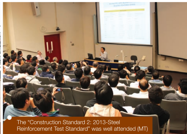
The "Construction Standard 2: 2013-Steel Reinforcement Test Standard" was well attended (MT)