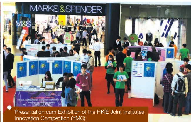
Presentation cum Exhibition of the HKIE Joint Institutes Innovation Competition (YMC)