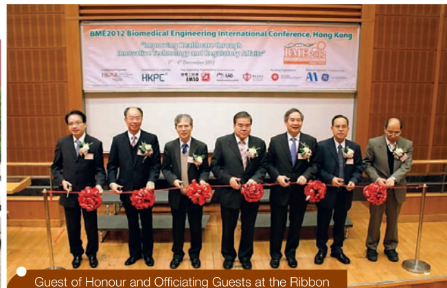
Guest of Honour and Officiating Guests at the Ribbon Cutting Ceremony of Biomedical Engineering International Conference 2012 (BME2012) Opening (BM)