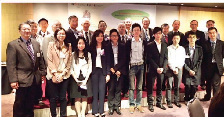
A group photo of the Organising Committee and speakers taken at the Engineering Exposition - From Engineering Career to Life Challenges (YMC)