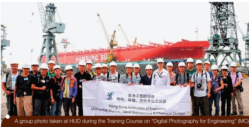
A group photo taken at HUD during the Training Course on "Digital Photography for Engineering" (MC)