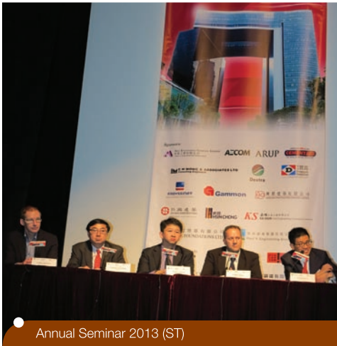
Annual Seminar 2013 (ST)