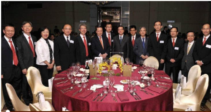
Annual Dinner 2012 (ST)