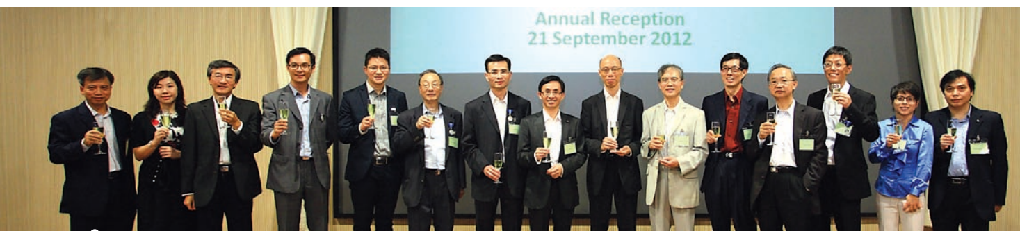
Guests of Honour and Committee Members proposing a toast at the Annual Reception (EV)