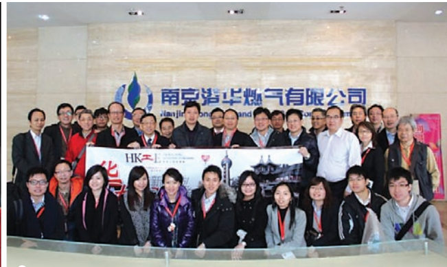
A group photo taken during the visit to Shanghai Hongqiao Low Carbon Business Centre (BS)