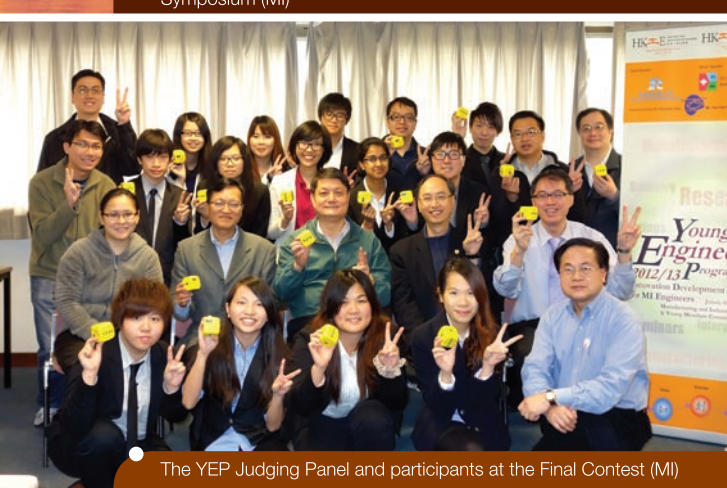
The YEP Judging Panel and participants at the Final Contest (MI)