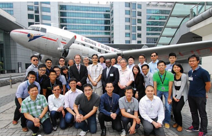
A class photo taken at Cathay City during the Airworthiness Workshop (AC)