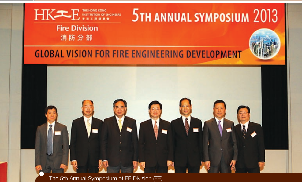
The 5th Annual Symposium of FE Division (FE)