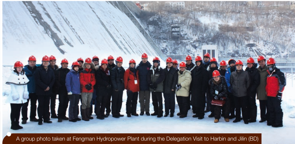
A group photo taken at Fengman Hydropower Plant during the Delegation Visit to Harbin and Jilin (BD)