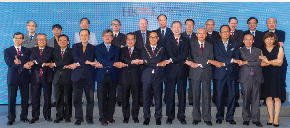
△ Presidential Address 2016-2017

The Institution’s effort to maintain our internationally recognised professional standards was rewarded with verification of its “full member” status under the APEC Engineer and the International Professional Engineers Agreement, which was extended for another six years from June 2016. Moreover, the Sydney Accord Monitoring Review, which took place in January 2017, affirmed the extension of the HKIE’s “full signatory” status under the Sydney Accord for another six years from June 2017. Given the change in Hong Kong’s secondary and higher