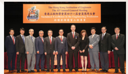
△ The 42nd Annual General Meeting

based Professional Assessment began in April 2017 and “Training-by-Objectives” under the HKIE’s Graduate Scheme “A” Training using the Competence-based Approach is being mapped out to ensure alignment with the new competences. Full implementation of the competence standard and enhanced assessment approach is on course to commence in 2019.