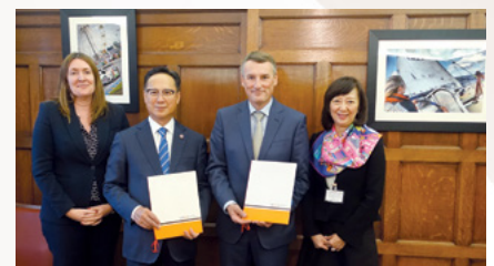
△ Signing Agreement of Co-operation with IET

The Institution’s effort to maintain our internationally recognised professional standards was rewarded with verification of its “full member” status under the APEC Engineer and the International Professional Engineers Agreement, which was extended for another six years from June 2016. Moreover, the Sydney Accord Monitoring Review, which took place in January 2017, affirmed the extension of the HKIE’s “full signatory” status under the Sydney Accord for another six years from June 2017. Given the change in Hong Kong’s secondary and higher