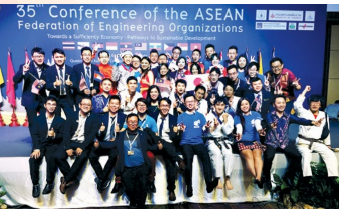
Delegation of the young engineers attending the ASEAN Federation of Engineering Organizations (YEAFO) supported each other for the country performances (YMC)