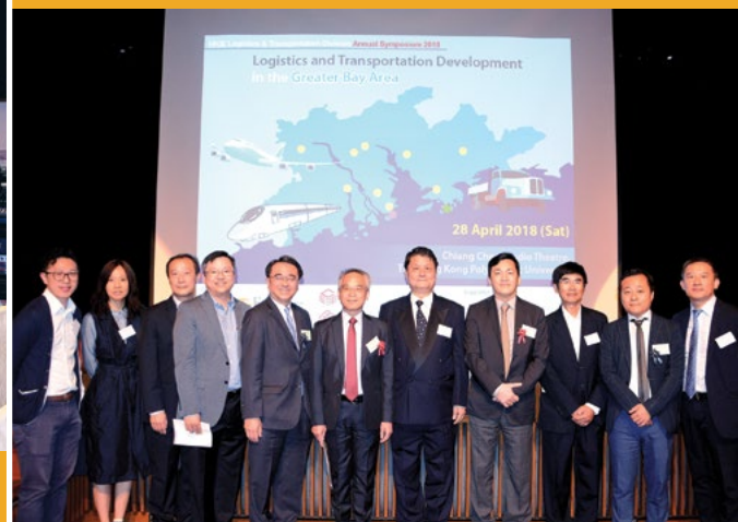
Group photo of members of the Organising Committee and speakers of the Annual Symposium (LT)