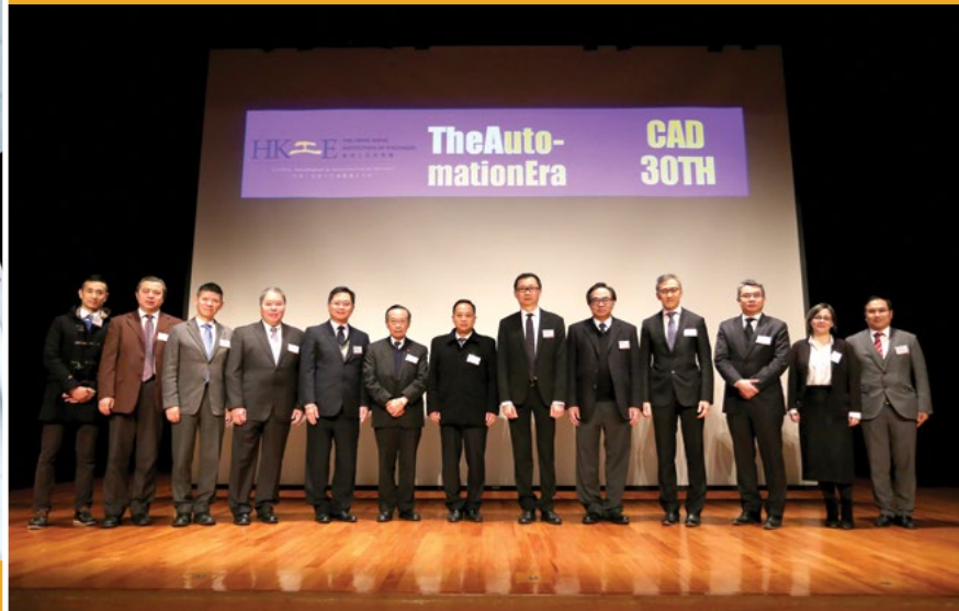
The 30th Anniversary Annual Symposium (TheA) on 9 February 2018 (CA)