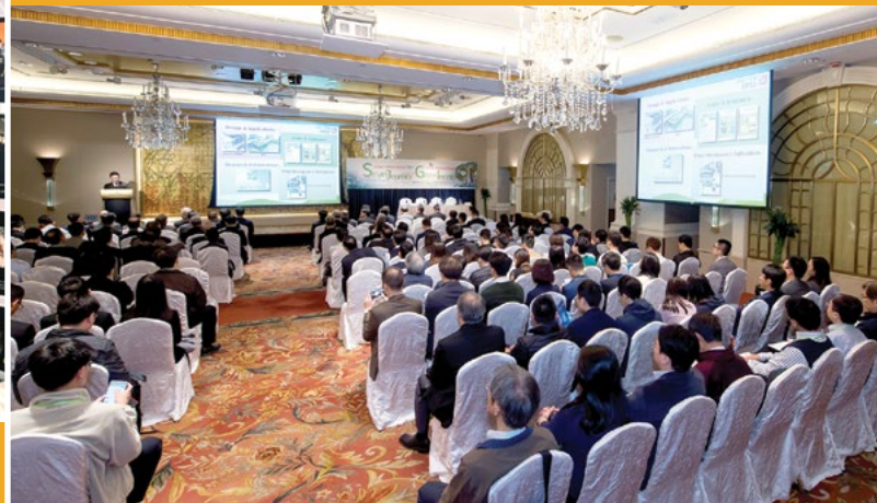
Hong Kong Joint Symposium 2017 (BS)