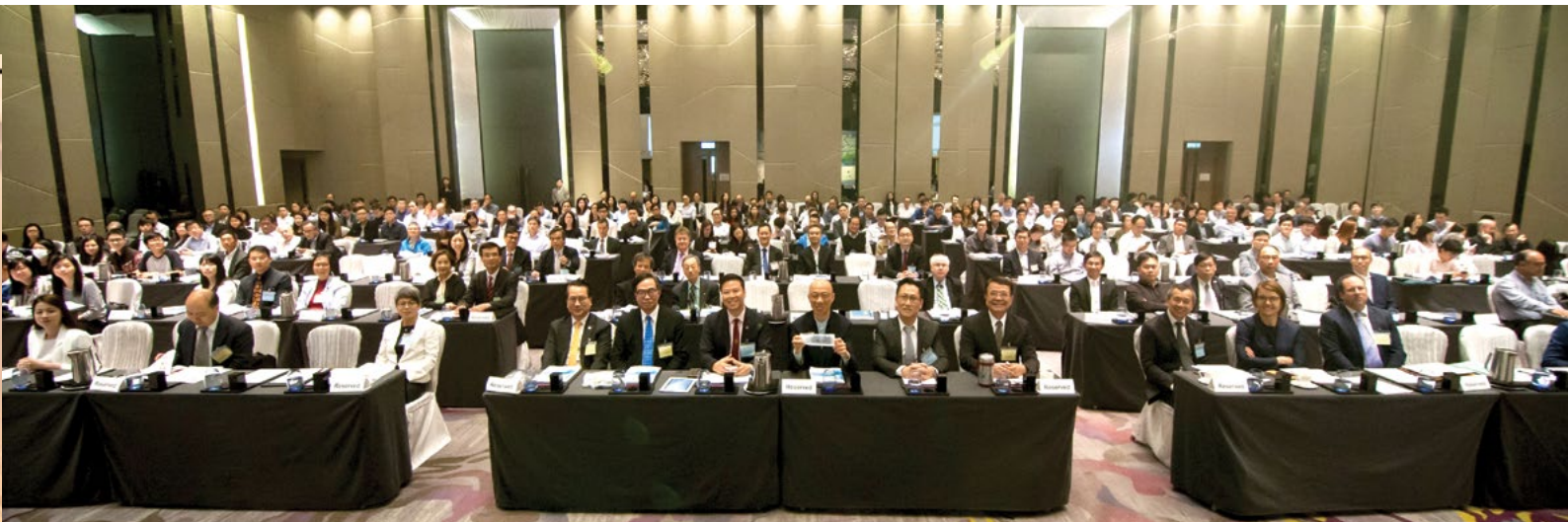
Full house of participants at the Environmental Division Annual Forum 2018 (EV)