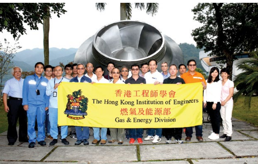
Group photo taken during the visit to Guangzhou Pumped Storage Power Station (EG)