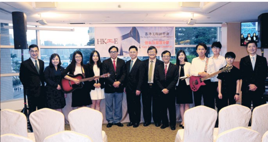
Photo of guests and the TECH Band at the Annual Dinner (EG)