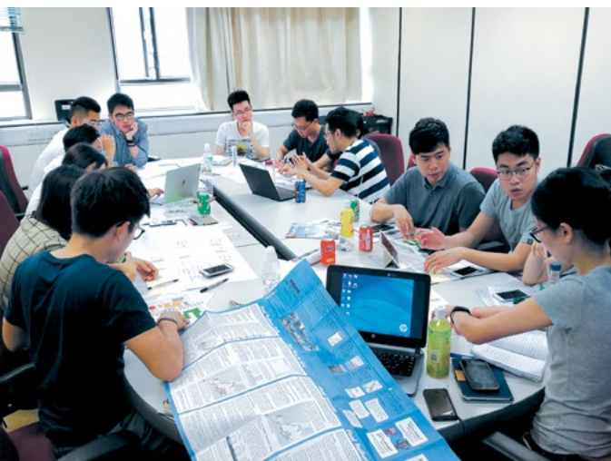
Young engineers carrying out detailed research for "The Future of Global Cities" (YMC)