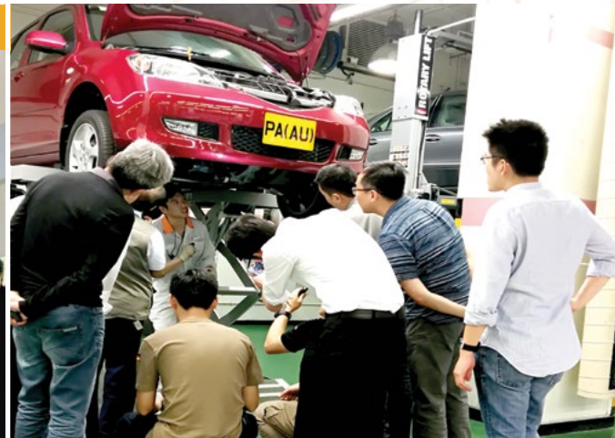
Participants carefully inspecting the car during the Short Course "Technical Aspects of Maintaining Cars Part I" (MC)