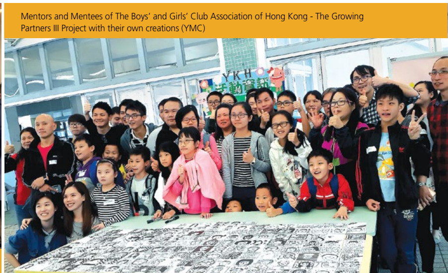
Mentors and Mentees of The Boys' and Girls' Club Association of Hong Kong - The Growing Partners III Project with their own creations (YMC)