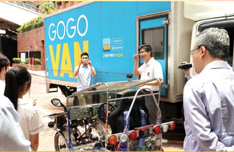
Final presentation by a student team in the Energy Innovation for Smart City Competition (EL)