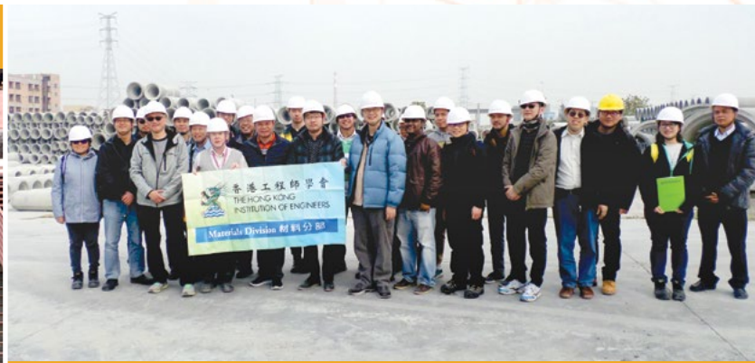
Technical visit to precast concrete pipe factory in Dongguan (MT)