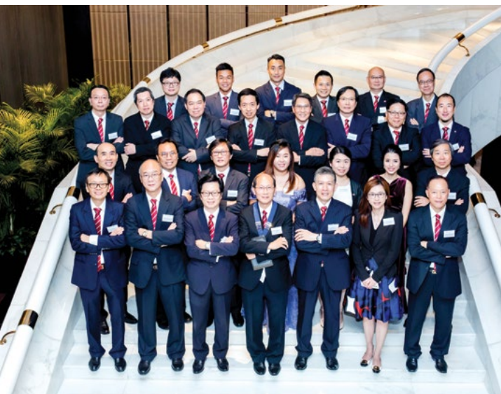
The 10th Anniversary Annual Dinner of the Fire Division (FE)