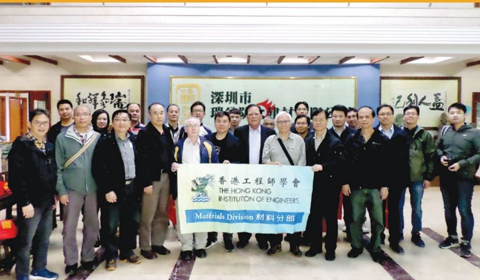
Group photo taken during the technical visit to the fire door factory in Shenzhen (MT)