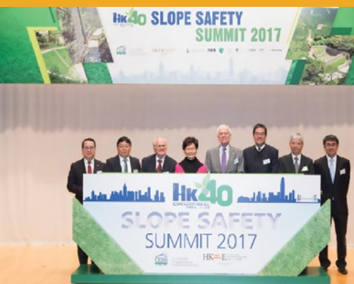
Officiating guests at the Slope Safety Summit (GE)

The HKIE SSC Safety Symposium was held on 22 June 2018 under the theme of "Safety Engineering - High-Risk Activities". Around 160 safety experts and practitioners, as well as guests and speakers, attended the symposium. The meaningful and fruitful symposium provided networking opportunities for safety experts and practitioners but was also a platform for participants and the guest speakers to exchange ideas on occupational safety and health-related issues.