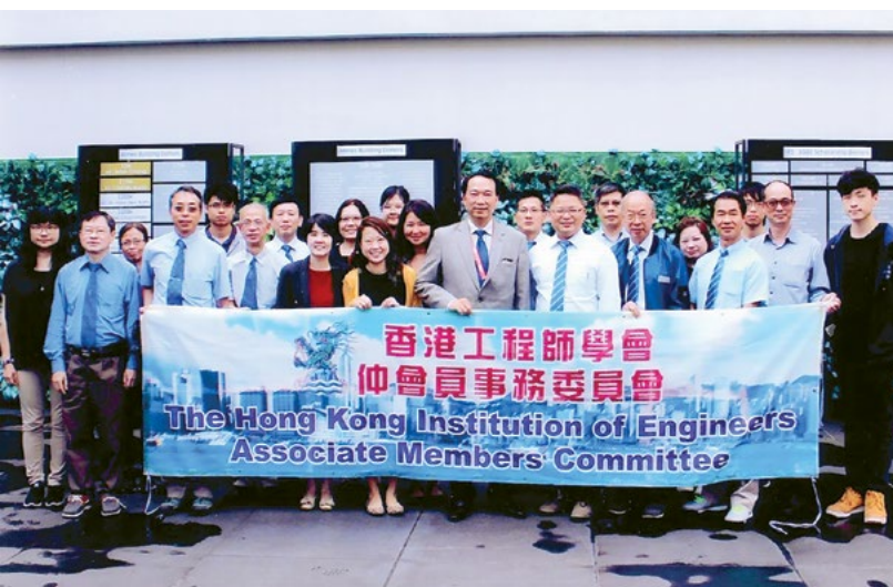
Visit to the Institution of Engineers Singapore (AMC)