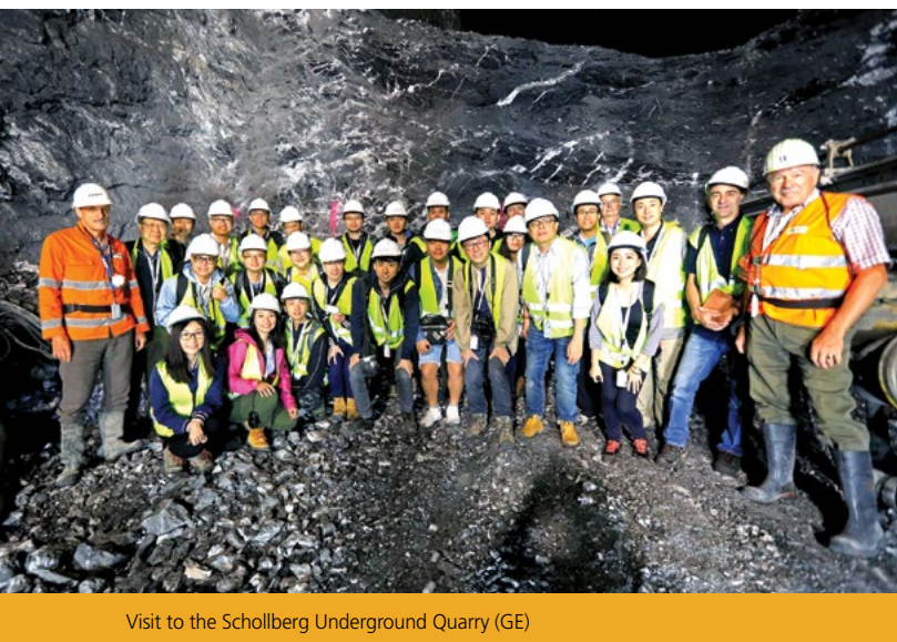
Visit to the Schollberg Underground Quarry (GE)