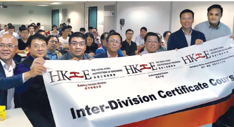
Full house of members attending the Inter-division Certificate Course (EV)