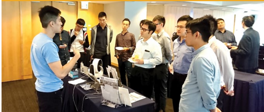
Invited speakers explained and demonstrated their products at Hong Kong Electronics Project Competition (HKEPC) Winners Conference (EN)