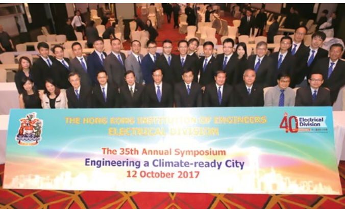
Members of the Symposium Organising Committee (EL)