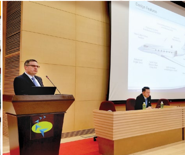
Technical Lecture on "The Next Generation Flight Deck - Gulfstream G500" (AC)