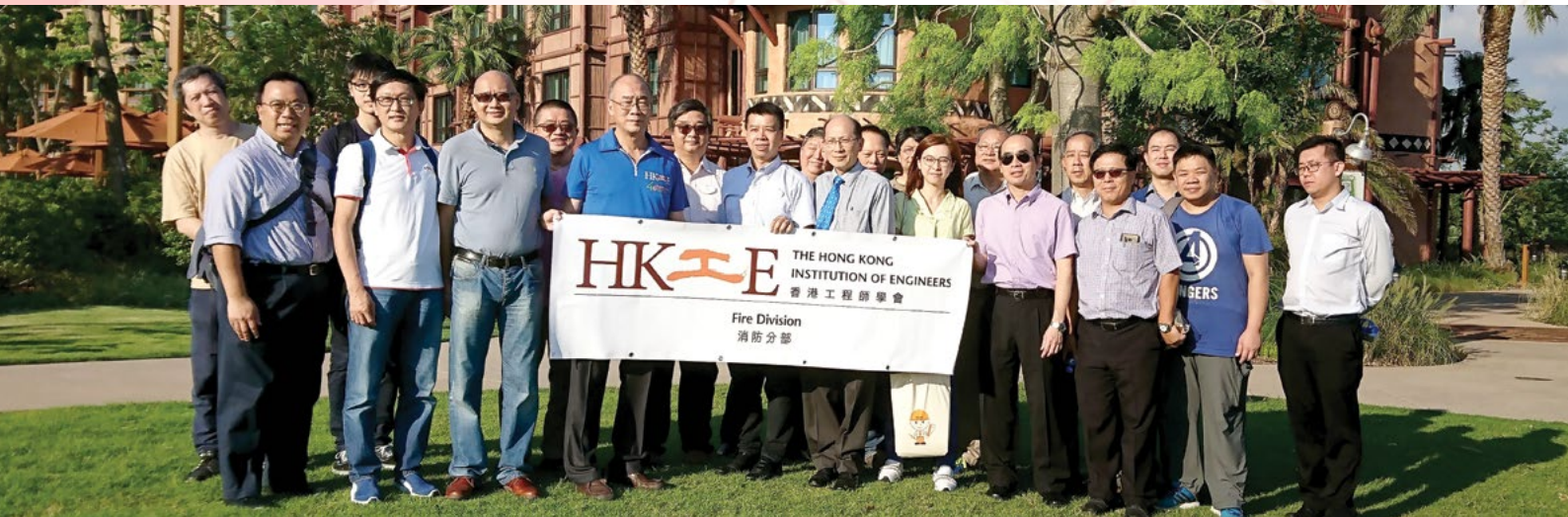
Technical visit to Hong Kong Disneyland Resort's Disney Explorers Lodge (FE)