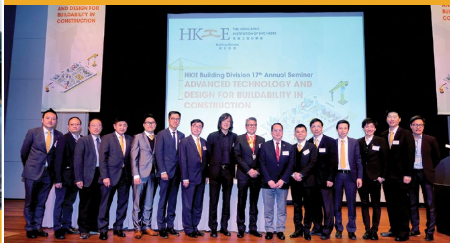
Group photo of speakers and members of the Organising Committee at the HKIE Building Division 17th Annual Seminar on "Advanced Technology and Design for Buildability in Construction" (BD)