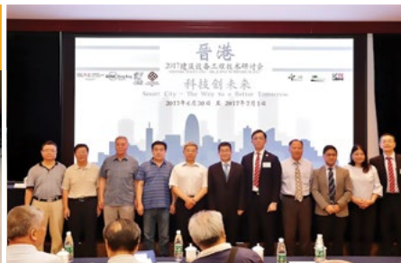
The Mainland-Hong Kong Joint Symposium 2017 (BS)