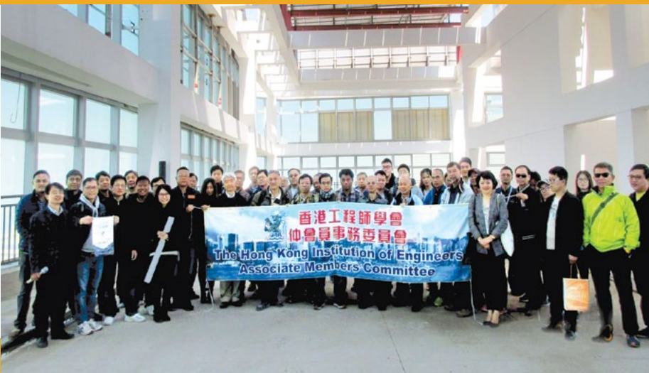
Technical Visit to Topray Solar (AMC)