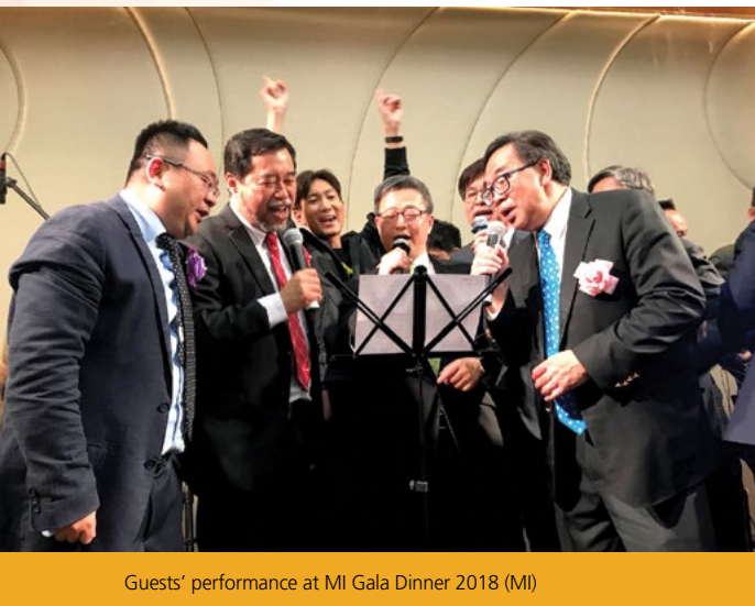
Guests' performance at MI Gala Dinner 2018 (MI)